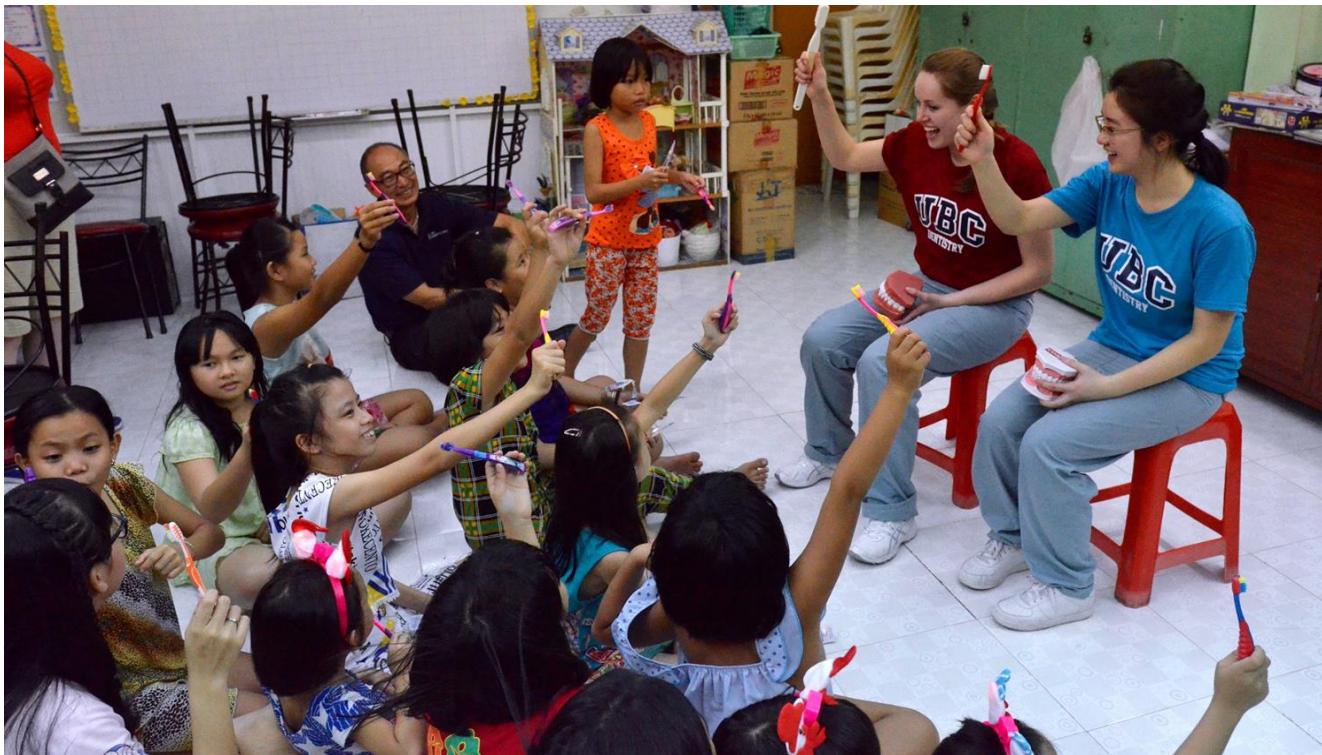
At Sunflower and Thien Phuoc Orphanages

UBC Student Learning: education, health promotion, and advocacy.