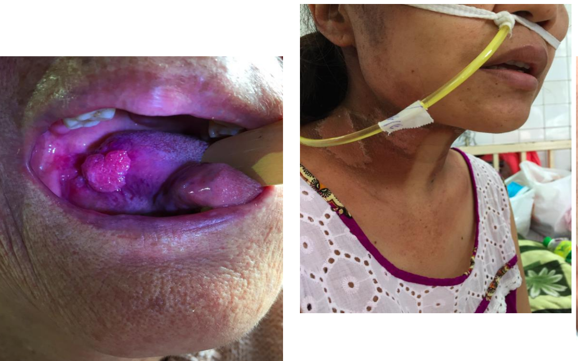
Left to right: Oral cancer of the tongue, radiation burns on neck, oral cancer on floor of the mouth