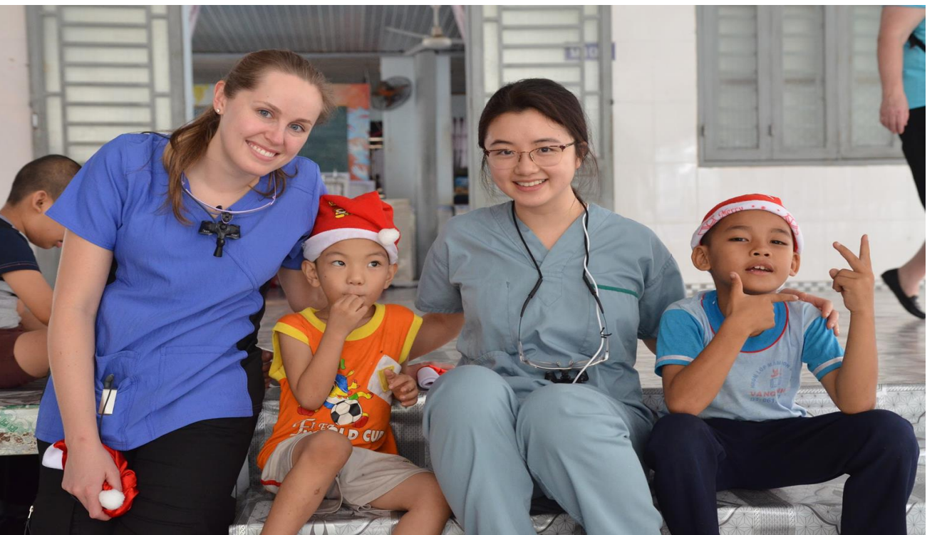
At St. Francis Shelter