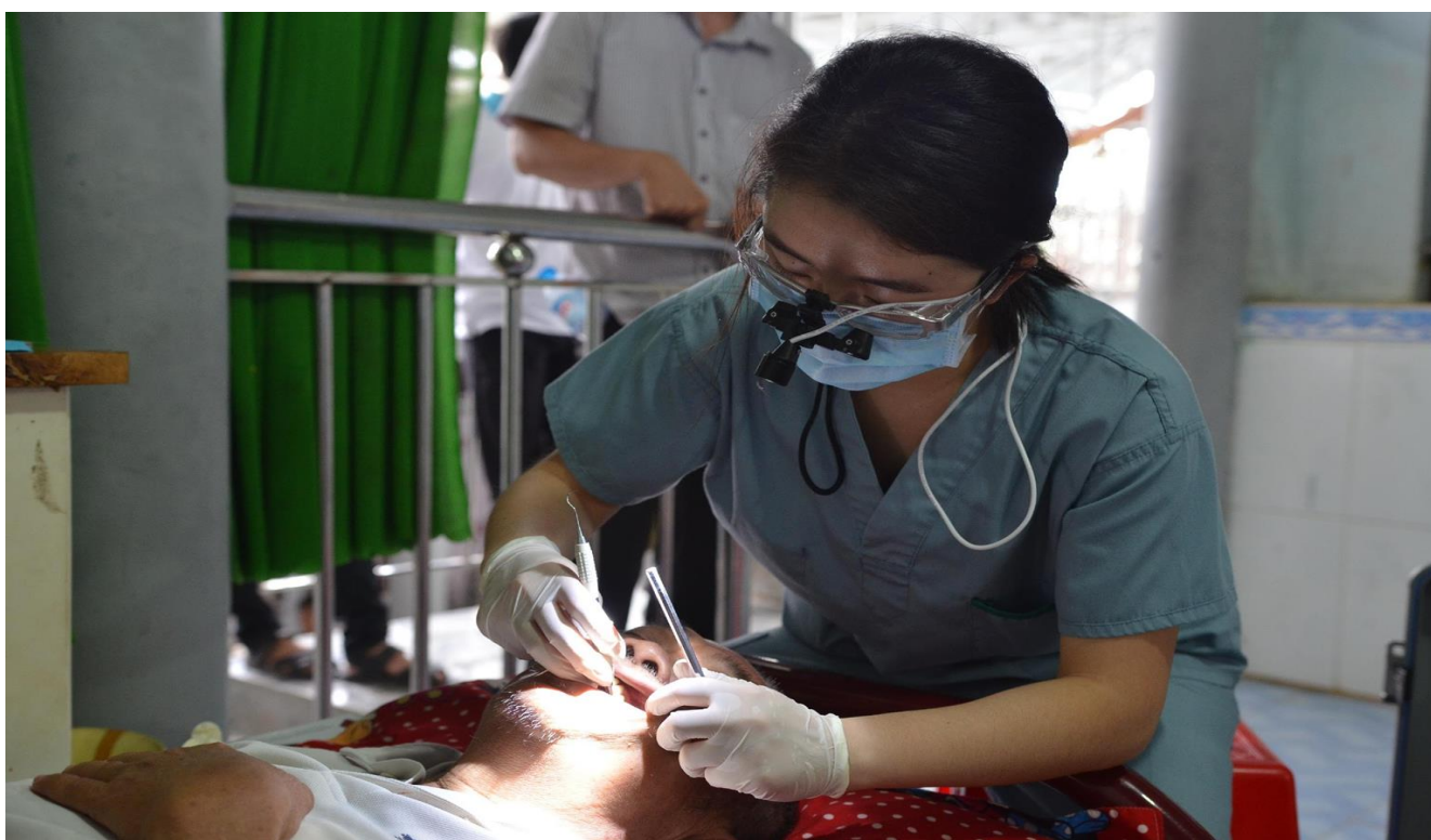
Providing oral health screenings and dental hygiene therapy to individuals living with disabilities