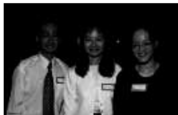
Grads' Night, University Golf Club, Nov. 7, 2000