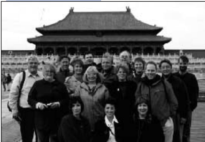
Travel and Learn in China participants in the Forbidden City, Beijing.

The tour provided a unique opportunity to travel with dental colleagues to a fascinating part of the world.