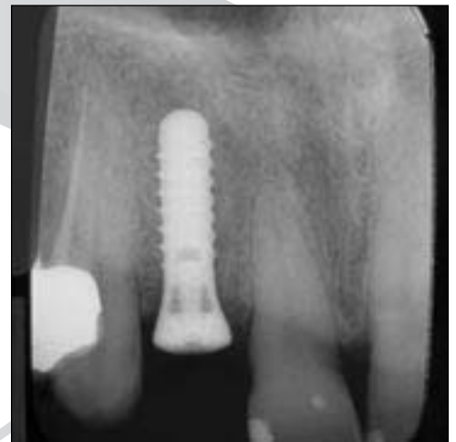
Endosseous implant replaces right lateral incisor.