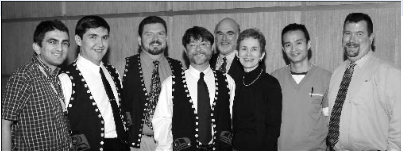
The Brighter Smiles project team.